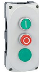
Grey control station LPZP3A8 complete with green flush pushbutton "i" LPCB1113 1NO, red extended pushbutton "o" LPCB2104 1NC and green pilot light 24V LPZP3B8911