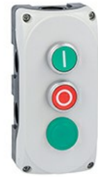
Grey control station LPZP2A8 complete with green flush pushbutton "i" LPCB1113 1NO, red flush pushbutton "o" LPCB1104 1NC and green pilot light 24V LPZP3B8910