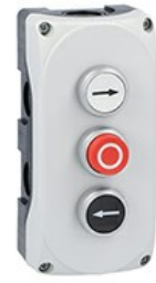
Grey control station LPZP3A8 complete with white flush pushbutton "right arrow" LPCB1148 1NO, red extended pushbutton "o" LPCB2104 1NC and black flush pushbutton "left arrow" LPCB1142 1NO LPZP3B8909