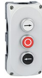
Grey control station LPZP3A8 complete with white flush pushbutton "right arrow" LPCB1148 1NO, red flush pushbutton "o" LPCB1104 1NC and black flush pushbutton "left arrow" LPCB1142 1NO LPZP3B8908