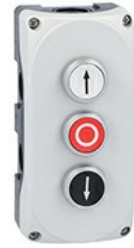
Grey control station LPZP3A8 complete with white flush pushbutton "up arrow" LPCB1158 1NO, red flush pushbutton "o" LPCB1104 1NC and white flush pushbutton "down arrow" LPCB1152 1NO LPZP3B8906