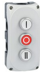
Grey control station LPZP3A8 complete with white flush pushbutton "i" LPCB1118 1NO, red flush pushbutton "o" LPCB1104 1NC and white flush pushbutton "ii" LPCB1128 1NO LPZP3B8904