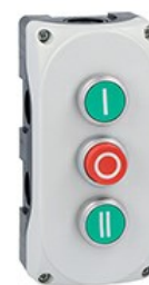
Grey control station LPZP3A8 complete with green flush pushbutton "i" LPCB1113 1NO, red extended pushbutton "o" LPCB2104 1NC and green flush pushbutton "ii" LPCB1123 1NO LPZP3B8903