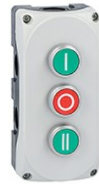
Grey control station LPZP3A8 complete with green flush pushbutton "i" LPCB1113 1NO, red flush pushbutton "o" LPCB1104 1NC and green flush pushbutton "ii" LPCB1123 1NO LPZP3B8902