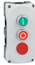
Grey control station LPZP2A8 complete with green flush pushbutton "i" LPCB1113 1NO, red flush pushbutton "o" LPCB1104 1NC and red pilot light 24V LPZP3B8900