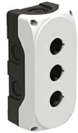
Plastic control station without actuators - for 3 actuators LPZP3A8