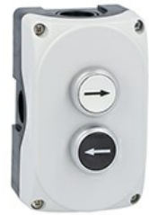
Grey control station LPZP2A8 complete with white flush pushbutton "right arrow" LPCB1148 1NO and black flush pushbutton "left arrow" LPCB1142 1NO LPZP2B8903