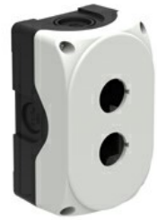
Plastic control station without actuators - for 2 actuators LPZP2A8