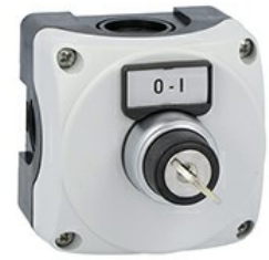
Grey control station LPZP1A8 complete with key selector lpcs320 1NO and label holder with label "o-i" LPZP1B8301