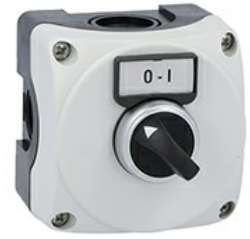
Grey control station LPZP1A8 complete with lever selector lpcs120 1NO and label holder with label "o-i" LPZP1B8300