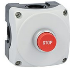
Grey control station LPZP1A8 complete with red extended pushbutton "stop" LPCB2134 1NC LPZP1B8105