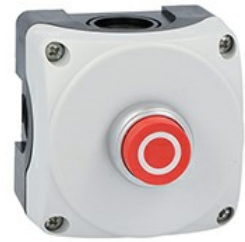
Grey control station LPZP1A8 complete with red extended pushbutton "o" LPCB2104 1NC LPZP1B8104