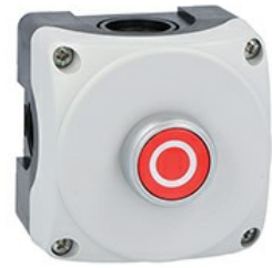
Grey control station LPZP1A8 complete with red flush pushbutton "o" LPCB1104 1NC LPZP1B8102