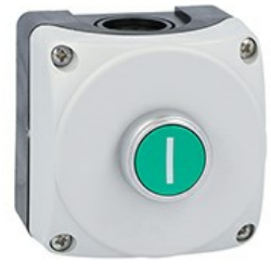
Grey control station LPZP1A8 complete with green flush pushbutton "I" LPCB1113 1NO LPZP1B8100