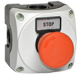
Plastic control station with one actuators - Grey, 1 way LPZP1A8 LPZP1B802