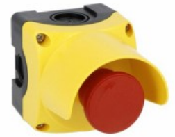
Yellow control station with shroud LPZP1A5P complete with mushroom pushbutton turn-to-release LPCB6644 1NC LPZP1B5P603