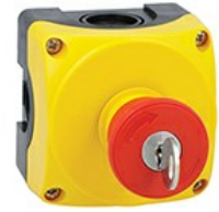
Yellow control station LPZP1A5 complete with mushroom pushbutton turn-key-to-release LPCB6844 2NC LPZP1B5606