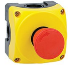
Yellow control station LPZP1A5 complete with mushroom pushbutton turn-to-release LPCB6344 1NC LPZP1B5602