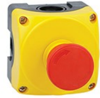
Yellow control station LPZP1A5 complete with mushroom pushbutton turn-to-release LPCB6644 2NC LPZP1B5601