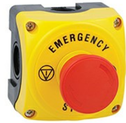
Yellow control station LPZP1A5 complete with mushroom pushbutton turn-to-release LPCB6644 1NC and "emergency/stop" disk LPZP1B5600