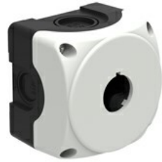
Plastic control station without actuators - for 1 actuators LPZP1A8