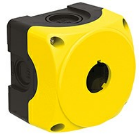
Plastic control station without actuators - for 1 actuators LPZP1A5