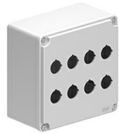
Enclosures with cut-outs for Ø22mm units - with multiholes for 8 actuators LPZM