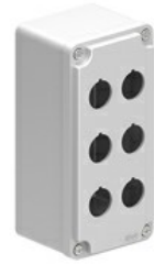
Enclosures with cut-outs for Ø22mm units - with multiholes for 6 actuators LPZM