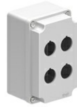
Enclosures with cut-outs for Ø22mm units - with multiholes for 4 actuators LPZM