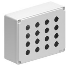
Enclosures with cut-outs for Ø22mm units - with multiholes for 16 actuators LPZM