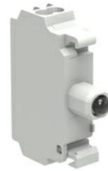
LED elements steady light with spring-clamp terminals LPXLP