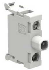
LED elements steady light base mount on LPZ control station LPXLPB