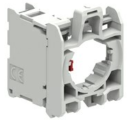
Contact elements - with mountin adapter LPXE