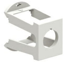
Adapter for mounting LPC... buttons on DIN rail 35mm/1.38" wide (2 modules) LPXDIN