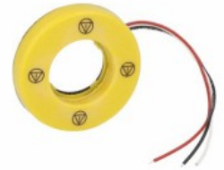
Illuminated disk for mushroom head pushbuttons - ISO13850 SYMBOL LPXDAU