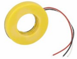
Illuminated disk for mushroom head pushbuttons LPXDAU