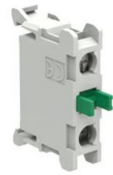
Contact elements, base mount on LPZ control station LPXCB