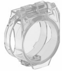
Protection cover for Ø22mm/ 5 0.015 0.87" push- buttons LPXAU170