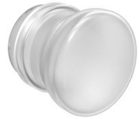
Rubber boot for mushroom head buttons, LPC B63/B66/B67/BL66... transparent LPXAU167