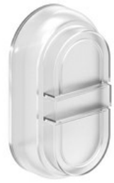
Rubber boot for double and triple-touch buttons, transparent LPXAU157