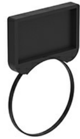
Label holder for engraved plastic LPX AU108 label LPXAU105