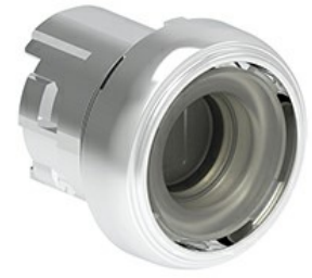
Spring return actuator without cap LPSXB0