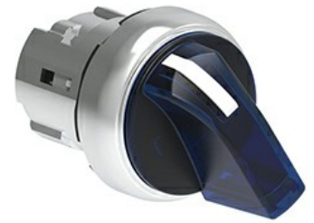
Illuminated selector switch actuator - 3 position LPSSL13