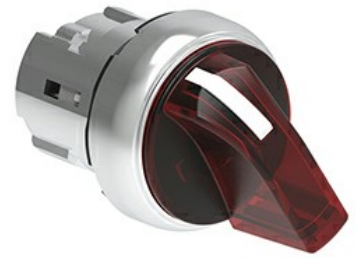
Illuminated selector switch actuator - 3 position LPSSL13