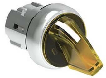
Illuminated selector switch actuator - 3 position LPSSL13