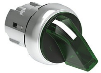
Illuminated selector switch actuator - 3 position LPSSL13