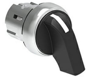
Selector switch actuators long lever - 2 position LPSS22