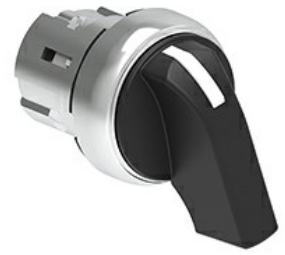
Selector switch actuators long lever - 2 position LPSS22