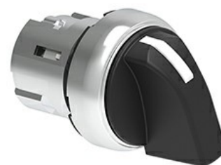
Selector switch actuators lever - 3 position LPSS13