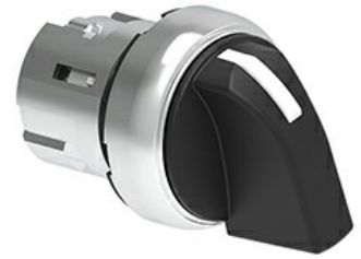
Selector switch actuators lever - 3 position LPSS13